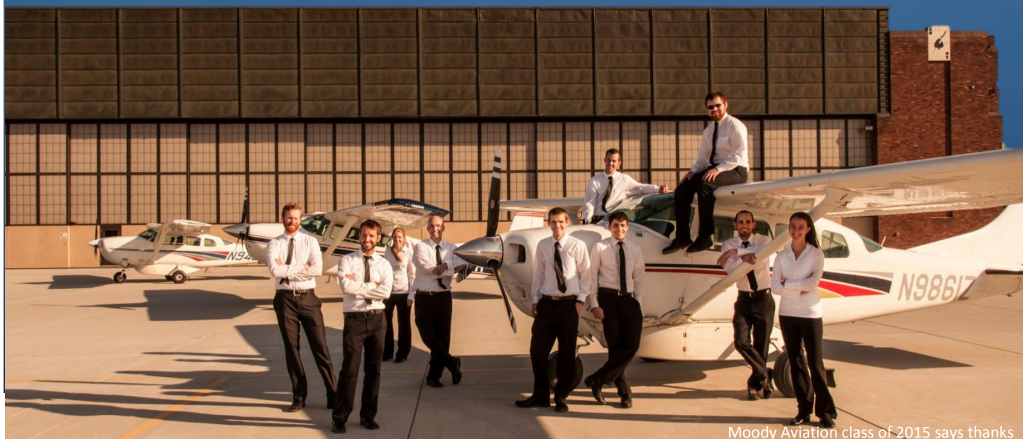
Moody Aviation class of 2015 says thanks